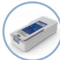
Inogen One ® G4 Extended Life Lithium Ion Battery** Up to 5 hours run time Item #BA-408