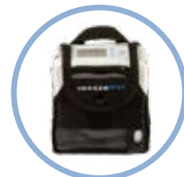
Inogen One ® G4 Carry Bag* Item # CA-400