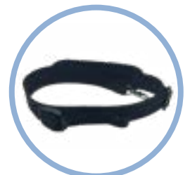
Inogen One ® G4 Carry Strap* Item # CA-401