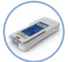
Inogen One ® G4 Lithium Ion Battery* Up to 3 hours run time Item #BA-400