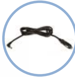
Inogen One ® G4 DC Power Cable* Item # BA-306