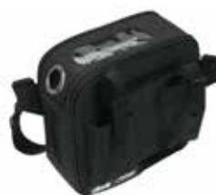
Carrying Case 125D-670