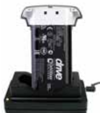
iGo2 Charging Station (Battery not included) 125CH-614