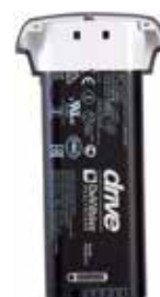
Rechargeable Battery 125D-613